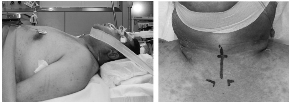
Figure 1. Obese patient (114 kg, body mass index: 35.9 kg/m 2 ) with a short neck. The shoulder pillow was inserted as usual, and the chin was pulled with an elastic tape to extend the neck. The cricoid cartilage was touched from the body surface. A vertical incision was made from the thyroid cartilage immediately above the clavicle.